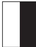
1/2 vertical 3 col. x 21" 7" x 21"