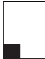
BACK 3 col. x 6" 7" x 6"