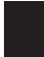
Full page 6 col. x 21" 14.125" x 21"