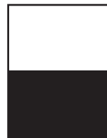
1/2 horizontal 6 col. x 10.5" 14.125" x 10.5"