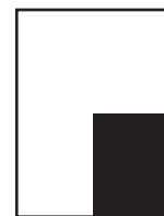
1/4 vertical 3 col. x 10.5" 7" x 10.5"