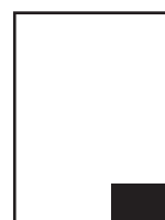
1/8 horizontal 3 col. x 5.25" 7" x 5.25"