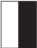
1/2 vertical 3 col. x 21" 7" x 21"