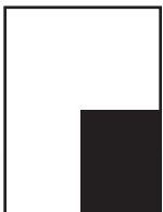
1/4 vertical 3 col. x 10.5" 7" x 10.5"