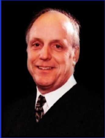
Hon. Wayne Andersen U.S. District Court, NDIL